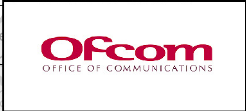
London AM3 MCA (Spectrum Radio) - 29th December 2003