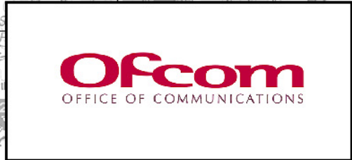
Reigate & Crawley AM MCA (Classic Gold 1521) - 29th December 2003