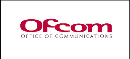
Canterbury FM MCA (KM-FM 106) - 29th December 2003