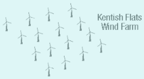
Kentish Flats Wind Farm